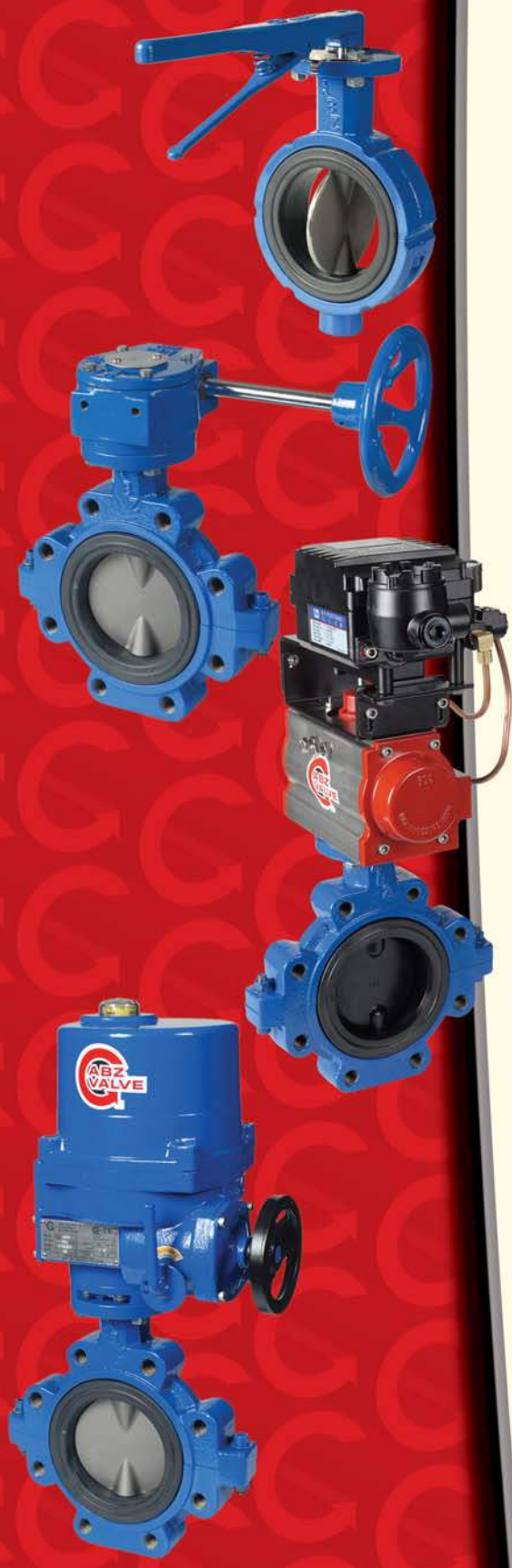
Rated Flow Coefficient (Cv) - Figure 090/929