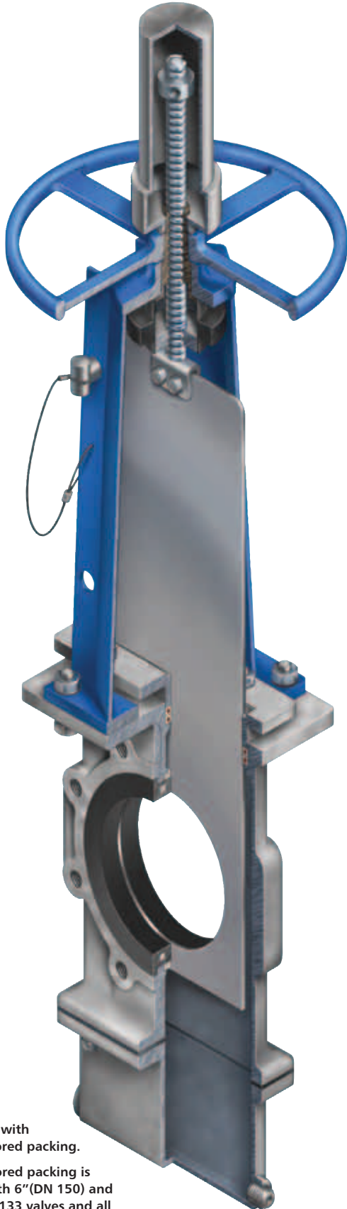
Figure C133 with energized cored packing.

Energized cored packing is standard with 6" (DN 150) and larger C33/C133 valves and all F33/F133 valves.